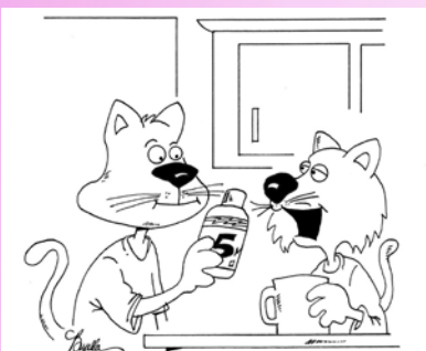
"Five minute energy drink...for those times when you want to race around the house for no reason whatsoever."

* Schedule a re-entry day. Before going back to work, take a day at home to unpack, return messages and restock the fridge. You'll stay more relaxed if you're not scrambling to catch up.