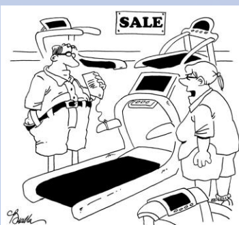
"I don't care if it's on sale. We have a perfectly good dust magnet at home."

Whether he or she lives or not, you will always know you did your part.